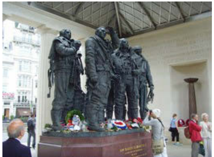
The Memorial a week later

Ed: I visited Green Park just a week after the unveiling and was pleased to see many fresh flowers, wreaths and crosses. Hopefully this remembrance will be a continuous cycle.