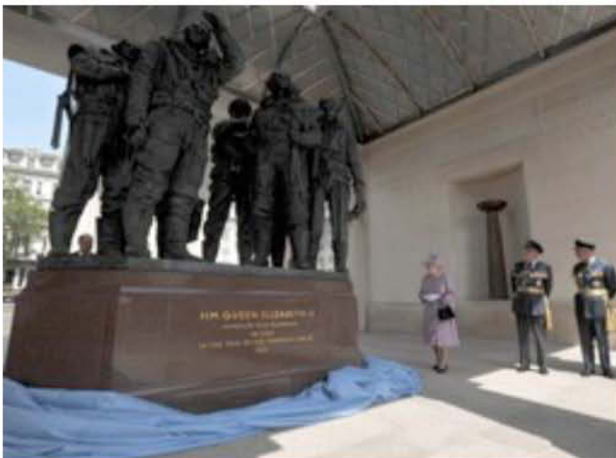
HM The Queen unveils the Monument with CDS and Controller of the RAF Benevolent Fund looking on

The Bomber Command Association and The Royal Air Force Benevolent Fund laid on a splendid programme of events, hosted by Carol Vorderman MBE, who has supported the venture from the outset. The crowds were huge but it was one of those events where there was pride in being able to say 'I was there' and the majority of course had the added momentum of 'being there for their mates'!